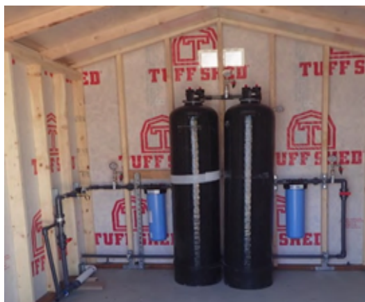
New Ion Exchange Filtration System