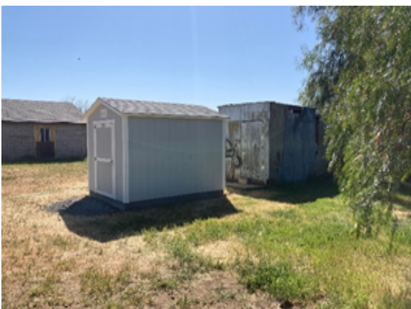
View of a new shed parallel with the well-head shed

During May and June 2021, the Air Force made progress with the installation of the new sheds (view photos below) which house the POETS, pressure tanks and ancillary piping/connections at the three agricultural properties.