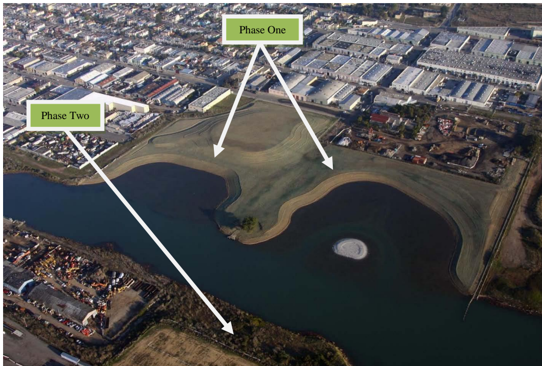
Figure 1. Aerial view of Cal Parks' Yosemite Slough Wetlands Restoration Project in December 2011. Phase One, which includes the bird nesting island, is complete. Phase Two is pending construction in 2014. Phase Three, which includes construction of the education center and interpretive trails, is scheduled for completion in 2015.

berm, left in place to allow construction without tidal interference, was breached over a 3-day period in November 2011, allowing the Bay to flow into the newly graded wetland areas. On January 19, Board staff participated in an event sponsored by the California State Parks Foundation that acknowledged supporters and project partners including the Board, the San Francisco Estuary Partnership, the Bay Conservation and Development Commission, and the California Coastal Conservancy.